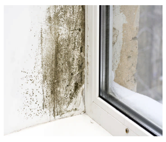
Mould damages because of bad humidity regulation

The problem of moisture and mould in homes is assuming ever greater proportions. This is partly due to the rising cost of energy and the resulting sometimes excessive energy-saving behaviour of ThermoZYKLUS consumers. has therefore developed a combined individual room control, at a critical combination temperature and air humidity, raises the target room temperature to a safe value or keeps a ventilator running long enough for the air humidity in the rooms to return to the comfort zone.